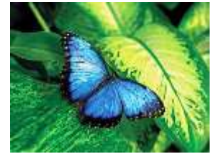
Reception - Butterfly