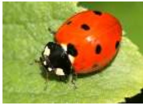
Nursery - Ladybirds